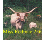
MISS REDMAC 256