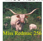
MISS REDMAC 256